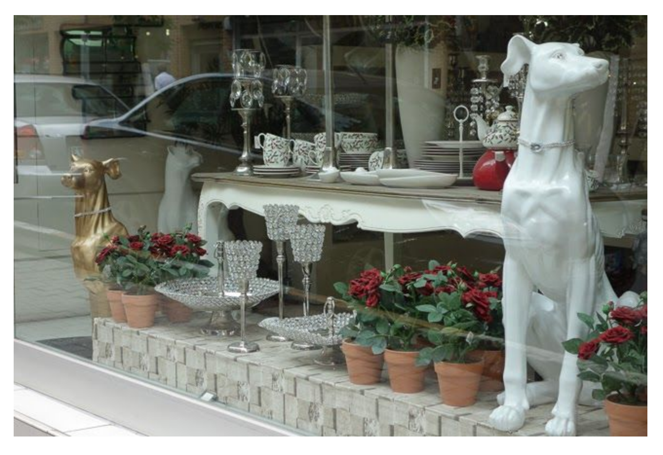
Istanbul Showrooms (White and Gold Greyhounds), 2013