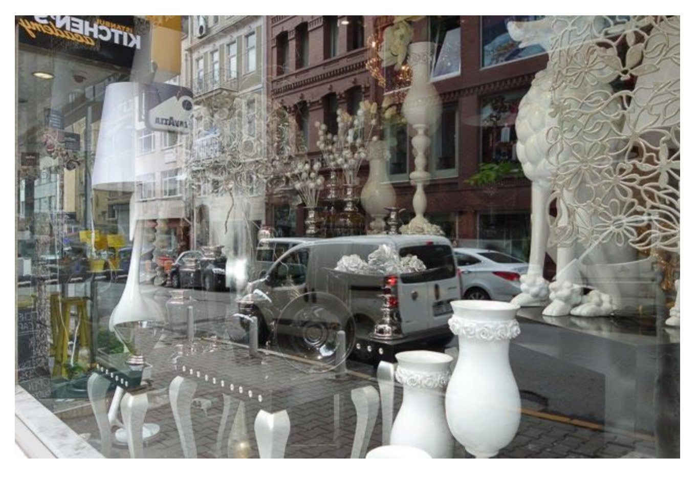
Istanbul Showrooms (White Poodle), 2013