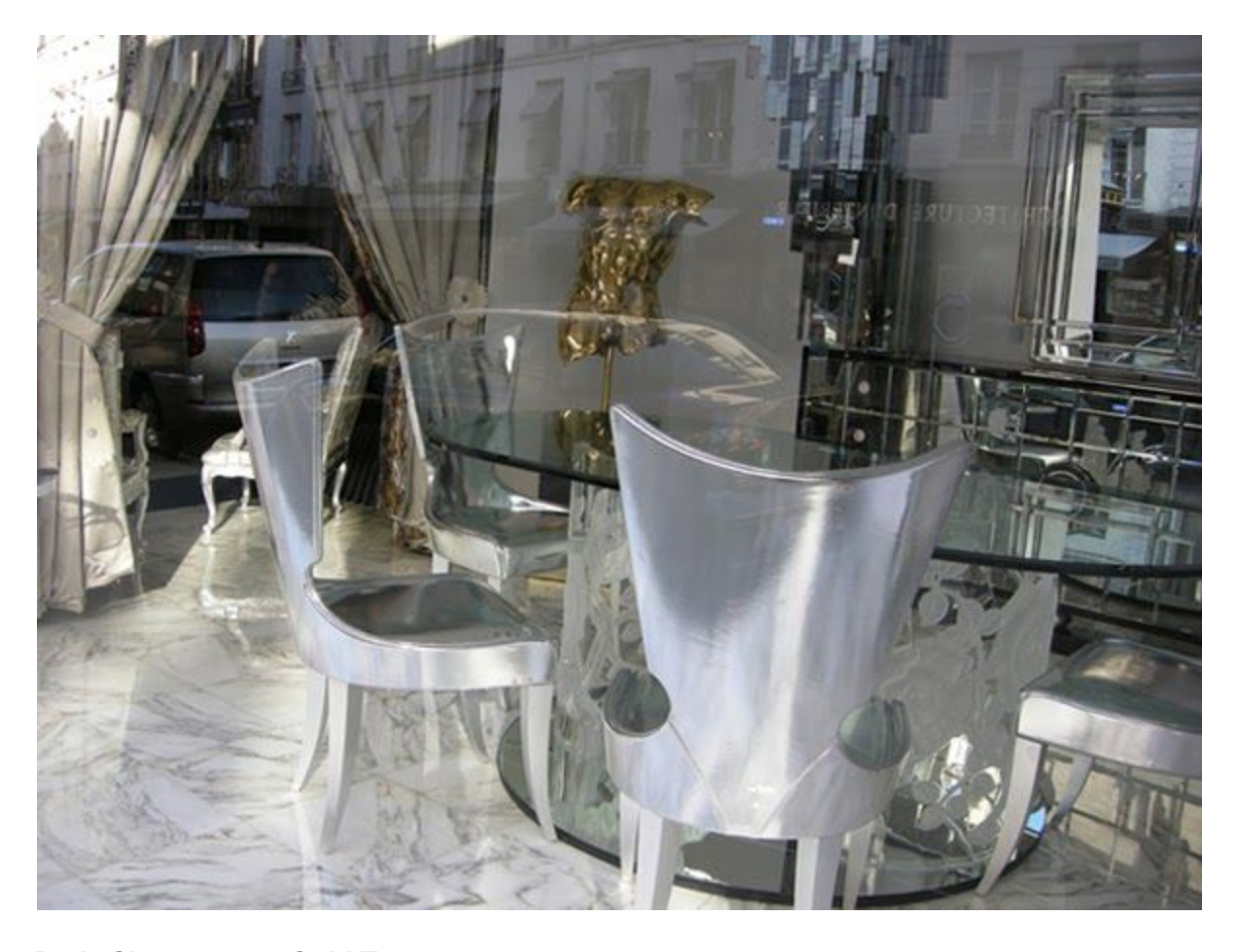
Paris Showrooms, Gold Torso, 2009